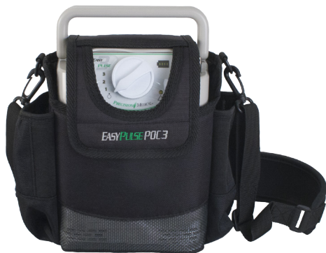
EasyPulse POC shown in Carry Bag