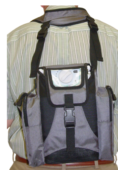
Back Pack PN 507303