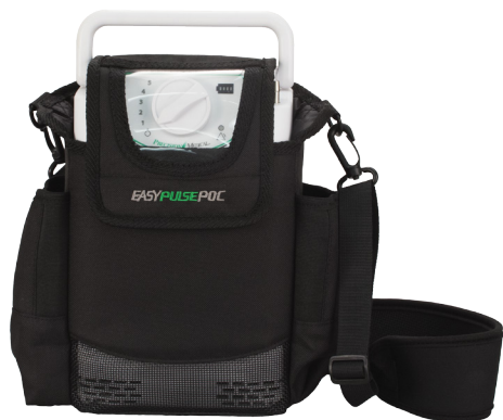
EasyPulse POC shown in Carry Bag